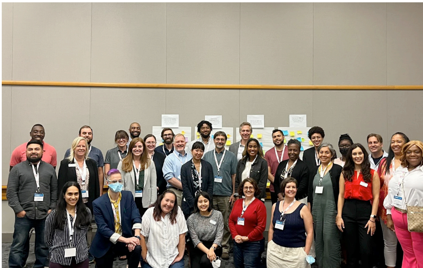
TEEM had our first in-person Annual Convening in Portland, Oregon where we spent time deepening relationships, collaborating on strategies, and co-determining our vision for the future of the community of practice.